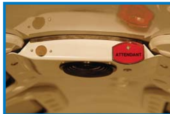
The warning system allows the patient to draw the doctor's attention to an emergency situation