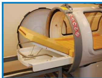
The stretcher has an adjustable headrest