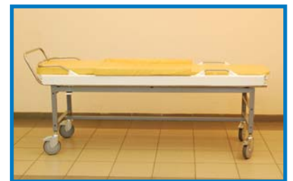
The gurney for the stretcher is fitted with wheels with breaks