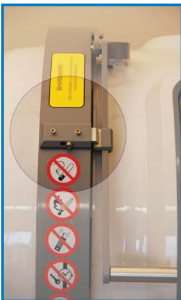
The construction of the hyperbaric chamber has a locking device on the cover