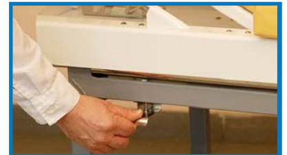
The gurney is equipped with parts for attaching the stretcher for patients